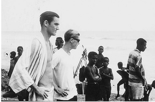
Publicity photos from the making of The Endless Summer